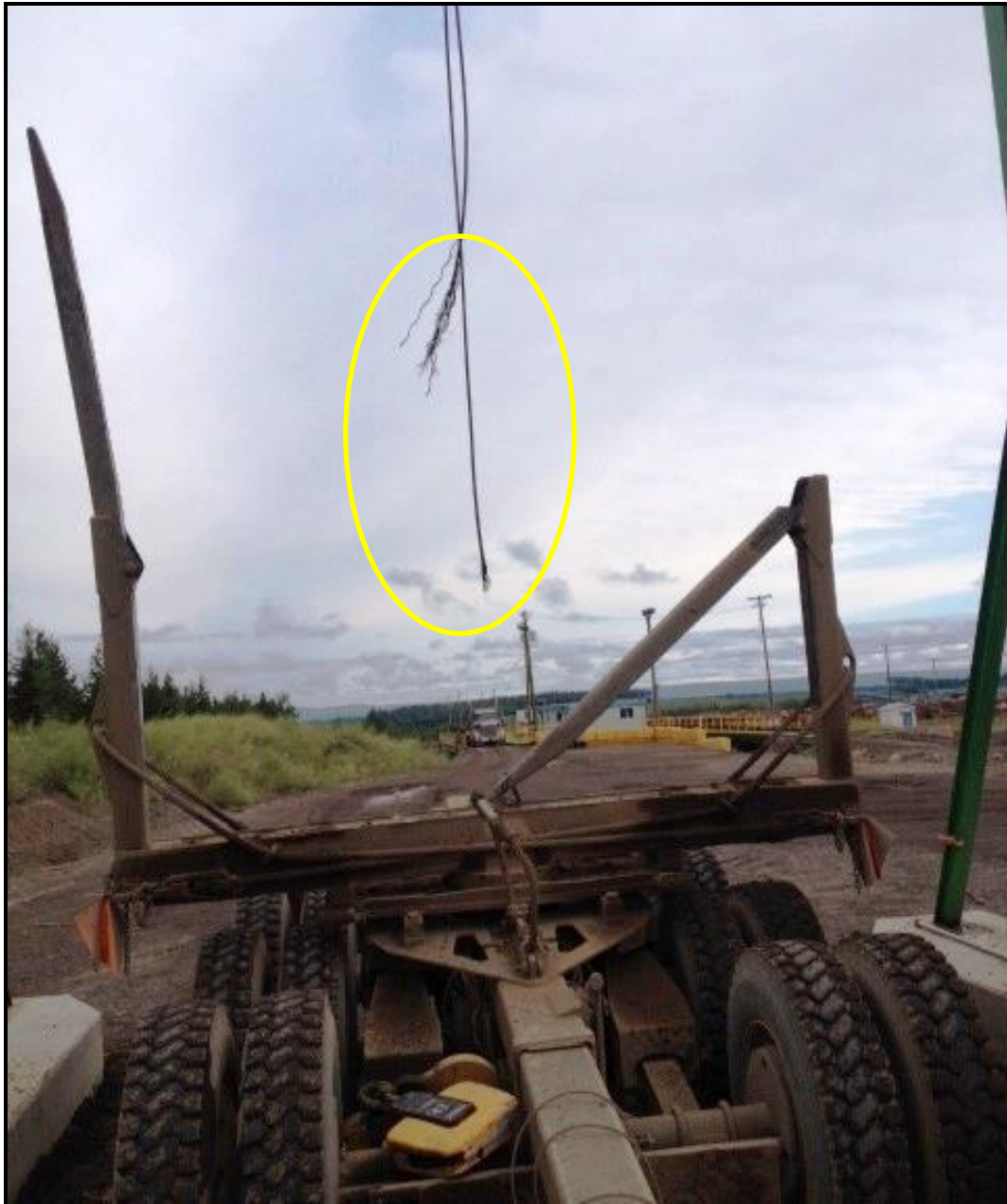
Photo above: The cable broke on the reload hoist. Fortunately the trailer was only suspended a foot above the ground, and the driver was in a safe zone.